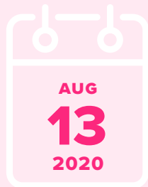
Back to school